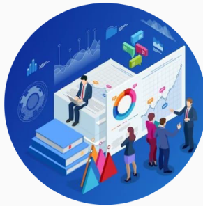
A ction & Business Management