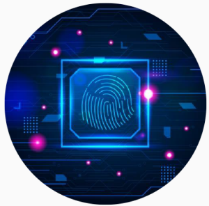
A I & Microservice Platform