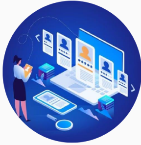
H R Management System